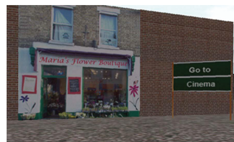
FIGURE 1: Cognitive Map Test. (a) Schematic map of the city. Numbers indicate the location of the landmarks (1: cinema; 2: flower shop; 3: hotel; 4: bar; 5: pharmacy; 6: restaurant). (b) View of the participants' starting position in one trial of the retrieval task.

556 sec., SD = 149.51; Naives: mean = 546.31 sec., SD = 226.18; t_{1,32} = -0.14 ; n.s.) or CMT-retrieval (Users: mean = 355.4 sec., SD = 105.7; Naives: mean = 315.11 sec., SD = 99.98; t_{1,32} = -1.14 ; n.s.) task. Moreover, a qualitative analysis of performance showed that all participants were able to reach the target locations in the CMT-retrieval task by following the shortest path. These data confirm that both groups of participants were able to form a cognitive map of the environment and to use it for navigational purposes.